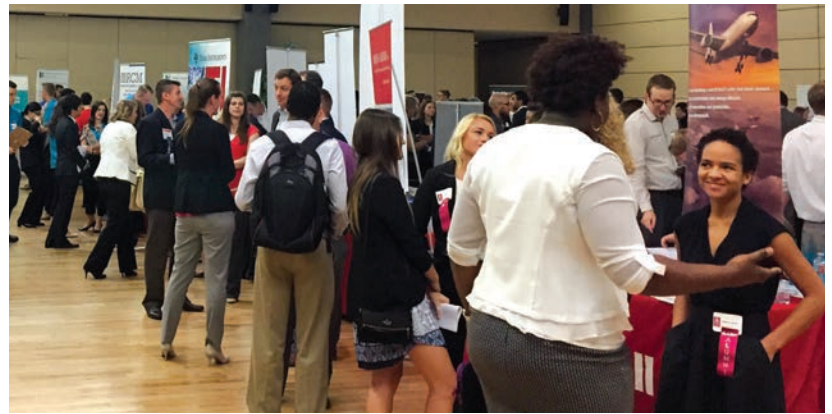
Meet the Firms