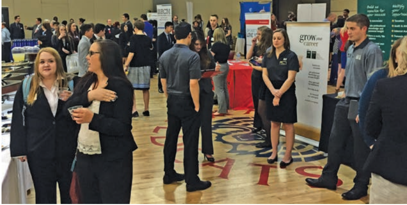
Meet the Firms